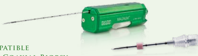
TRUGUIDE® Coaxial Biopsy Needle

SURPRISINGLY SMALL... AMAZINGLY POWERFUL, COMPATIBLE WITH THE BARD® TRUGUIDE® COAXIAL BIOPSY NEEDLE - FOR ENHANCED EFFICIENCY AND ACCURACY