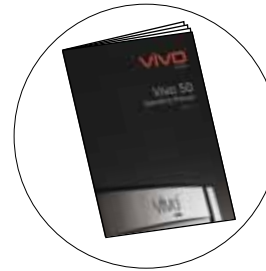
005003 Operating Manual