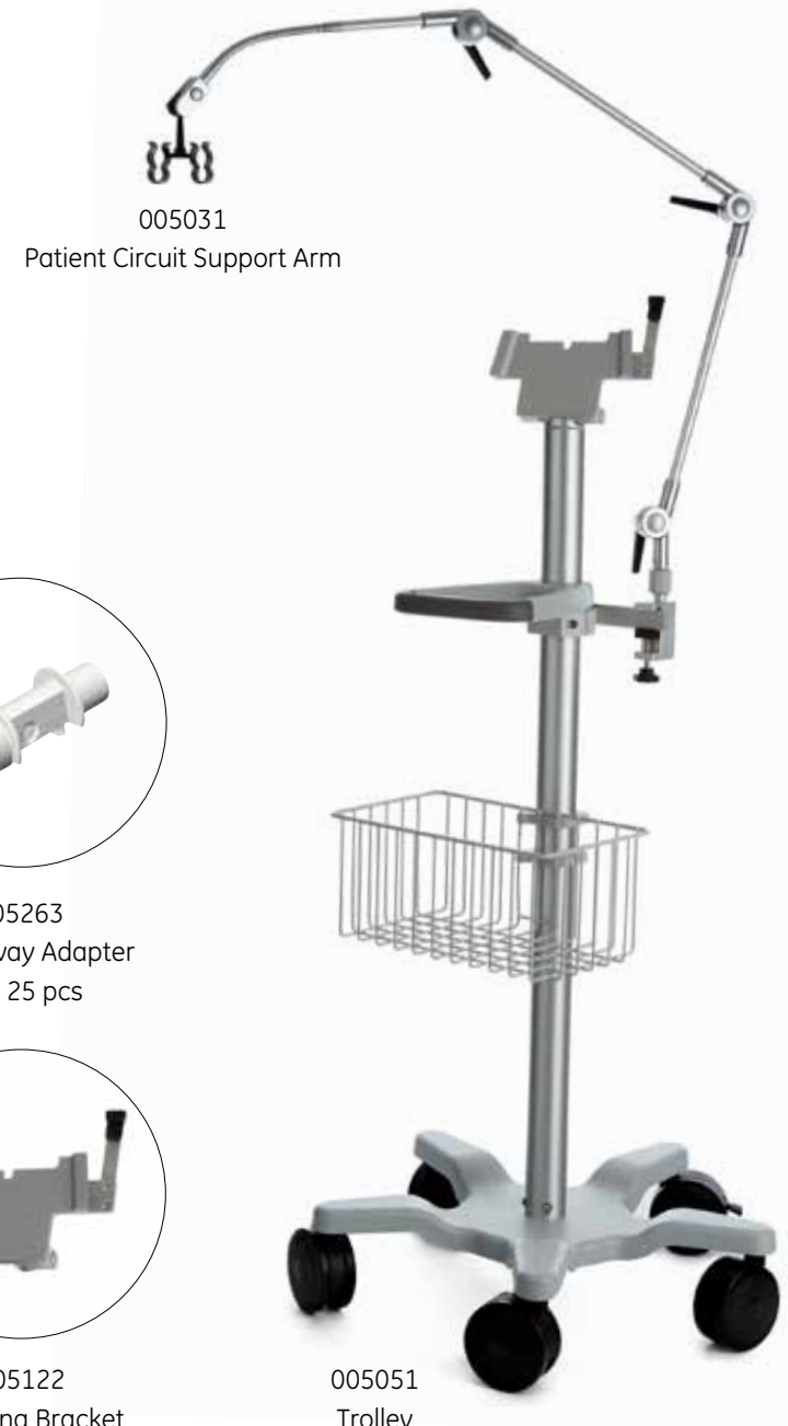
005031 Patient Circuit Support Arm