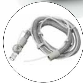
005055/005050 Patient Circuit with Exhalation Valve, Reusable/Disposable