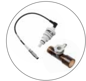
004888 Oxygen Sensor, 004895 Cable for Oxygen Sensor, 005120 T-Piece for Oxygen Sensor