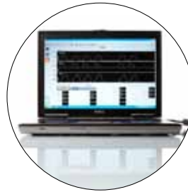
005100 Vivo 50 PC Software