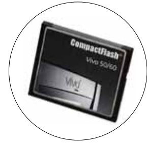
003619 Memory Card