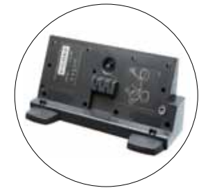
004559 Li-Ion Click-On Battery