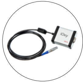
005067/005068 iOxy Vivo 50 incl Finger Clip Sensor/Flex Sensor