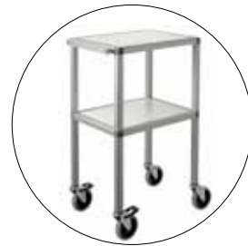
003443 Ventilator Table

* Vivo by Breas is a trademark of General Electric Company