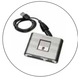
002185 Memory Card Reader