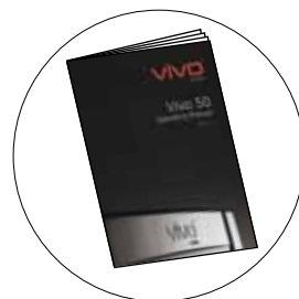
005003 Operating Manual