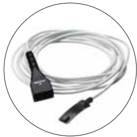
002064 SpO 2 Flex Sensor (Nonin 8000J)