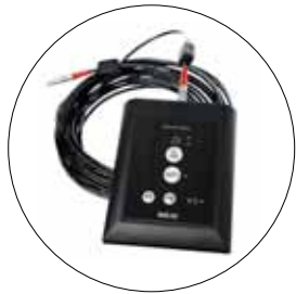
005036/005223 Remote Alarm incl Cable 10m/25m