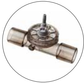
000485 Exhalation Valve, Reusable