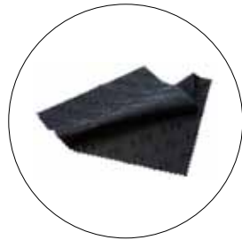
005066 Polishing Cloth