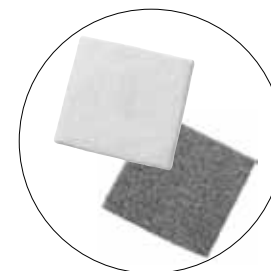
004909/004910 Patient Air Inlet Filter