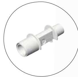
005263 CO 2 Airway Adapter Box 25 pcs