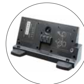
004559 Li-Ion Click-On Battery