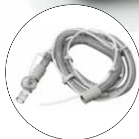
005055/005050 Patient Circuit with Exhalation Valve, Reusable/Disposable