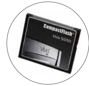
003619 Memory Card