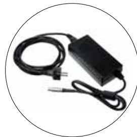
005186 (EU) 005187 (UK)/005188 (AU) Charger for Li-Ion Click-On Battery