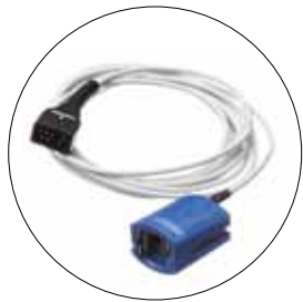
002063 SpO 2 Finger Clip Sensor