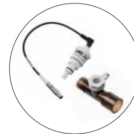
004888 Oxygen Sensor, 004895 Cable for Oxygen Sensor, 005120 T-Piece for Oxygen Sensor