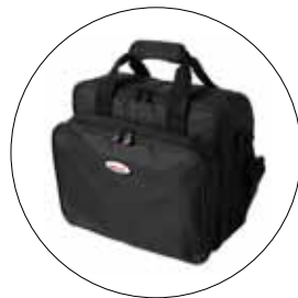
004939 Carry Bag