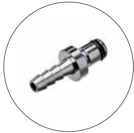
005032 Oxygen Adapter Low Pressure