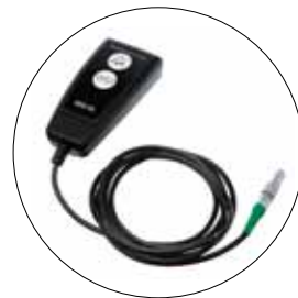
004695 Remote Start/Stop