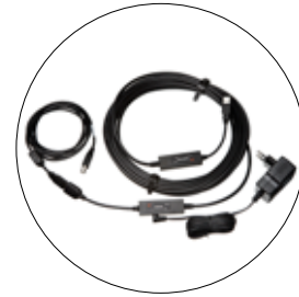
005092 (EU) 005093 (UK)/005094 (US) Isolated USB Cable Kit