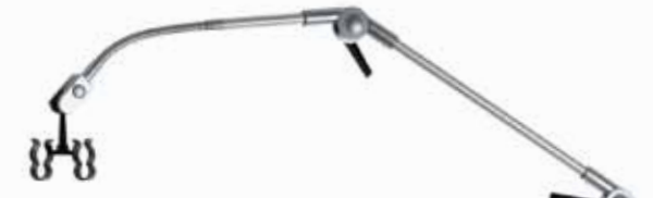
005031 Patient Circuit Support Arm