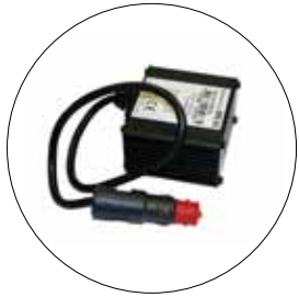
004901 12-24 V Converter