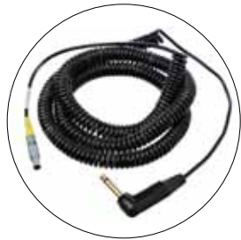
004891/004892/004893/004894 Nurse Call Cable No/Nc, No 10K Ohm/Nc 10K Ohm