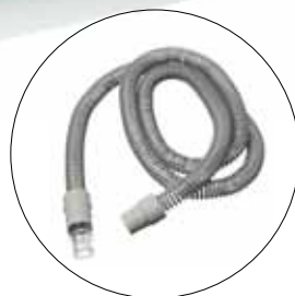
005065/005060 Patient Circuit with Leakage, Reusable/Disposable