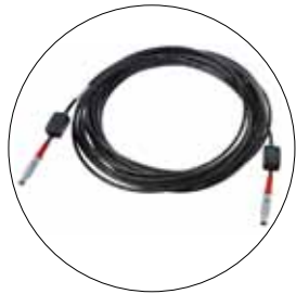
004896/004897/004898 Cable for Remote Alarm 10m/25m/50m