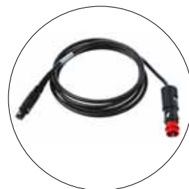
004899 External Battery Cable 24 V DC