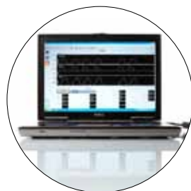
005100 Vivo 50 PC Software