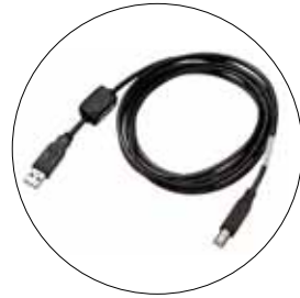
004886 USB Cable A-B