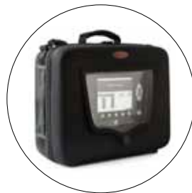
004938 Protective Cover