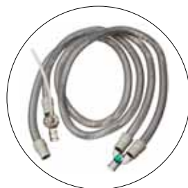
005114/005118 Patient Circuit dual limb with active Exhalation Valve, Reusable/Disposable