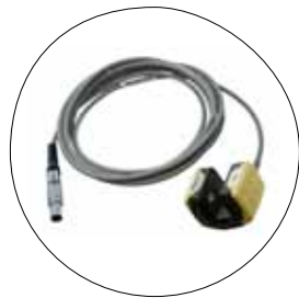
004903 CO 2 Sensor