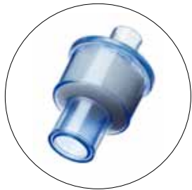
003974 Hygrosopic Condensor