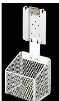
Wall mount kit Pole mount kit