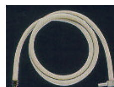
Air tube 1,3m

(without picture) Wall hanging kit Pole-mounting kit