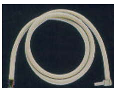
Air tube 1m