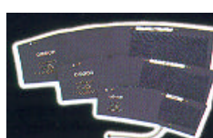
Small / Normal / Large Cuff