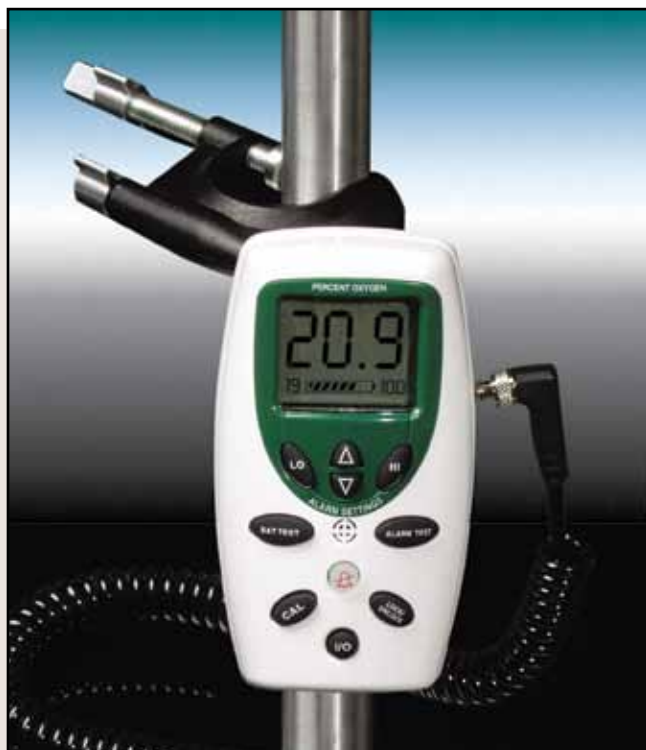
Easily secures to poles and shelves