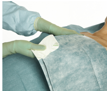
6 Secure adhesive edge one side at a time.