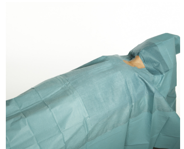
8 Unfold the drape over patient's head or anesthesia frame.