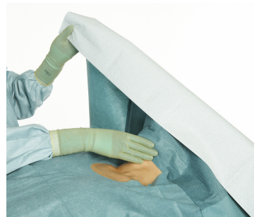
7 Position the adhesive op-sheet on the chin.