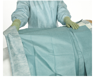
4 Unfold the split sheet towards patient's feet.