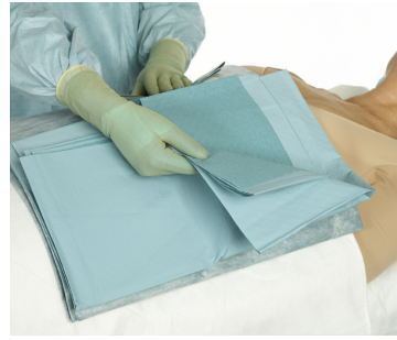
3 Unfold the drape side to side.