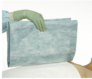
2 Position the split sheet in the middle of the chest.