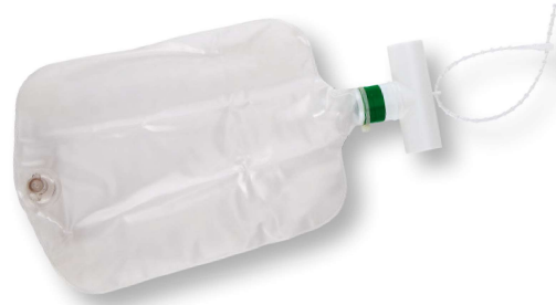
Aerosol Drainage System