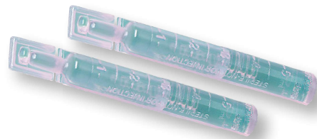
ADDIPAK Unit Dose