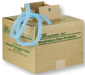
CORR-A-FLEX II Roll Tubing