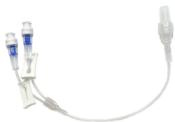
Figure 1. 20019E7DS BD SmartSite™ 'Y' Extension Set. 2 Needle Free Valves

The BD Pressure Rated Catheter Extension Sets are used for infusion therapy. The extension sets vary in length, configuration, power injection capability and priming volume. The pressure rating is specified on the product label.