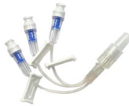
Figure 2. 20038E7DS BD SmartSite™ Extension Set. 3 Needle Free Valves