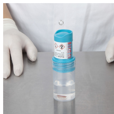
6. The biopsy is ready for transportation.