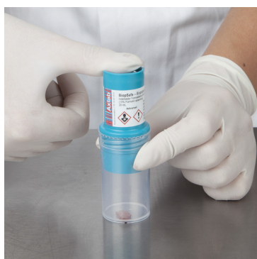
4. The formalin is released with a press of the thumb.