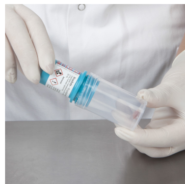
3. The lid is screwed on.