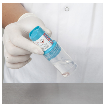
5. The formalin and the biopsy is mixed.