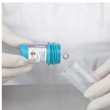
1. The lid is screwed off.