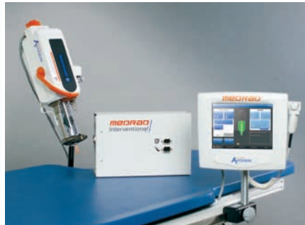
Table Mount The small power supply allows mounting flexibility – under the table, in control room, in store room