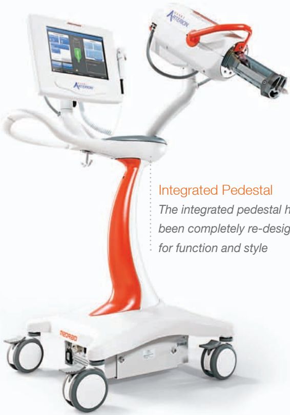
Integrated Pedestal The integrated pedestal has been completely re-designed for function and style

Arterion™ offers multiple configurations for maximum configuration flexibility