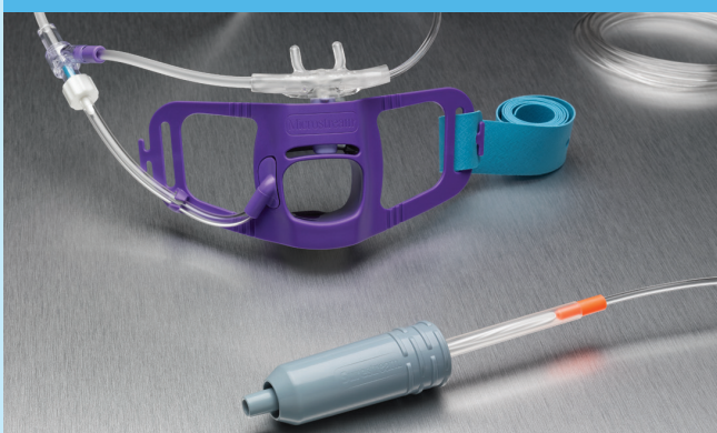
Smart SureLine™ Guardian O 2 patient sampling set includes CO 2 sampling line and Guardian bite block – Adult/Pediatric 015106