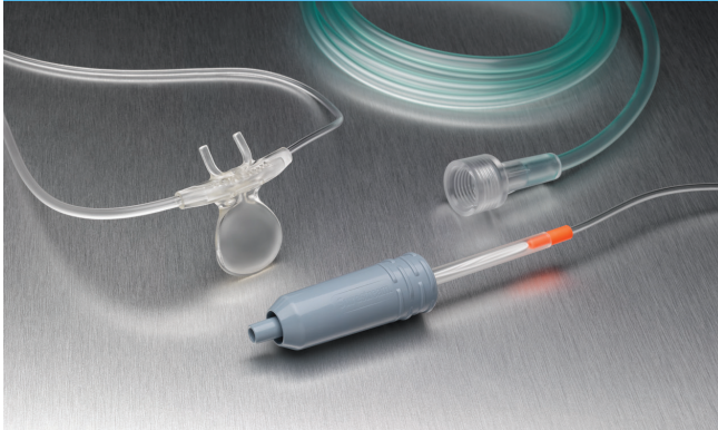
Smart SureLine™ Plus O 2 patient sampling line – Adult 015096