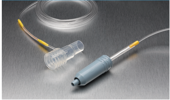
Sure VentLine™ H Set patient sampling line – Adult/Pediatric 015103