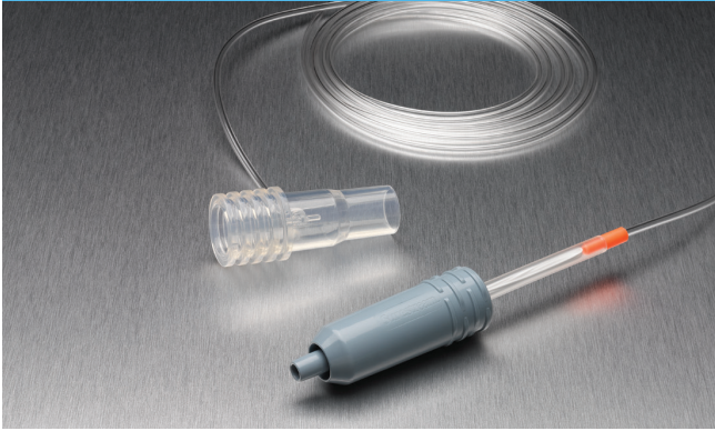
Sure VentLine™ Set patient sampling line – Adult/Pediatric 015102