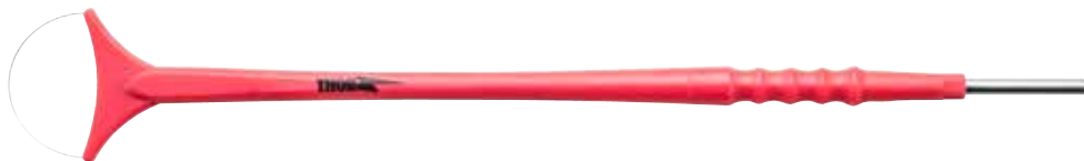
0440 LLETZ LOOP 20mm x 10mm (13cm)