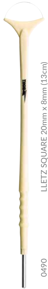
LLETZ SQUARE 20mm x 8mm (13cm)