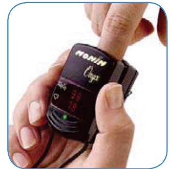
Onyx®, The World's First Fingertip Pulse Oximeter

The Nonin Onyx is the most widely used and trusted fingertip pulse oximeter by clinicians and patients worldwide. The Onyx is a proven performer with the widest range of patients from pediatric to adult, light to dark skin tones and good to low perfusion. The accuracy of Onyx fingertip oximeters is a result of Nonin Medical's superior PureSAT® signal processing technology that removes noise, artifact and/or interference that may affect readings — providing consistently accurate oximetry readings you can depend on.