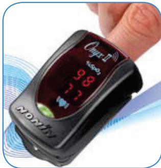
Onyx® II, Model 9560 - The World's First Bluetooth® Wireless Fingertip Pulse Oximeter

The Onyx II, Model 9560 with Bluetooth wireless technology is designed with our proven PureSAT® oximetry technology and delivers the trusted, precision accuracy of the entire Onyx line. And now with the advantage of wireless monitoring capabilities — the built to last and easy-to-use Onyx II 9560 provides unparalleled versatility for patient and clinician. Plus, with the addition of innovative new features such as Extended Range and Power Saver — it's ideal for home patient use.