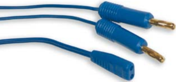
E0509 Footswitching Bipolar Forceps Cord Length: 3.6 m (12 ft)