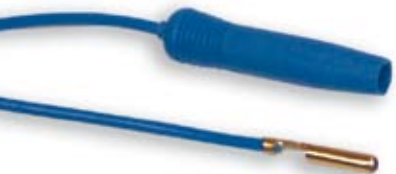
E0510 Footswitching Monopolar Laparoscopic Cord Requires E0502 Series or E0017 active adapter Accepts 4 mm male single prong plug Length: 3 m (10 ft)