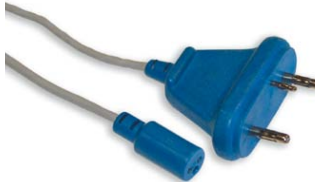
E0018 Handswitching Forceps Cord - Reusable For use with Valleylab generators only Length: 3.6 m (12 ft)