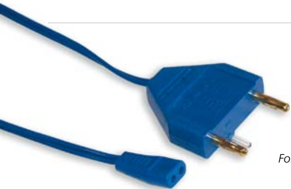
E0512 Footswitching Bipolar Forceps Cord For use with Valleylab generators only Length: 3.6 m (12 ft)