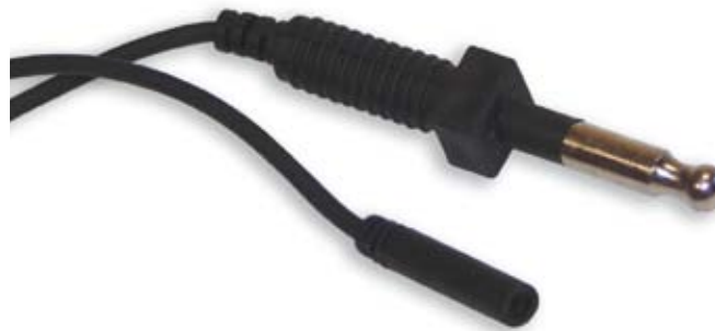
E2999 Footswitching Laparoscopic Cord - Reusable Accepts 4 mm male single prong plug Length: 3 m (10 ft)