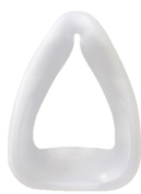
Chin Support (FP)™