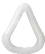
Wide Profile (RM)™