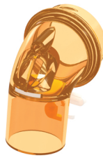
Anti-Asphyxia with Leak