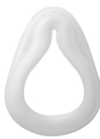
High Profile (RP)™