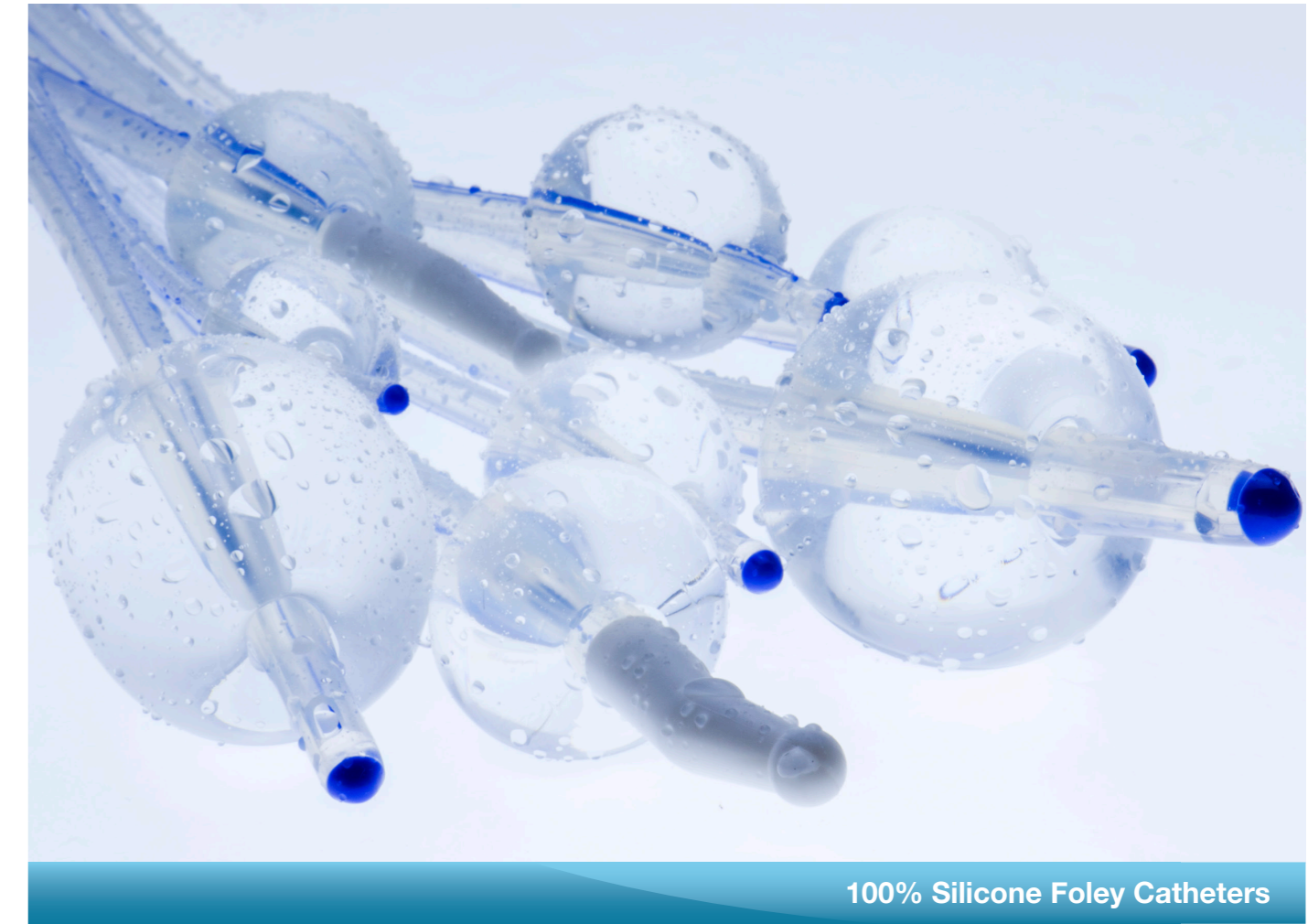
100% Silicone Foley Catheters

The complete product portfolio is free of latex, natural rubber allergenes and Phthalates, such as Bis(2-ethylhexyl) phthalate (DEHP).