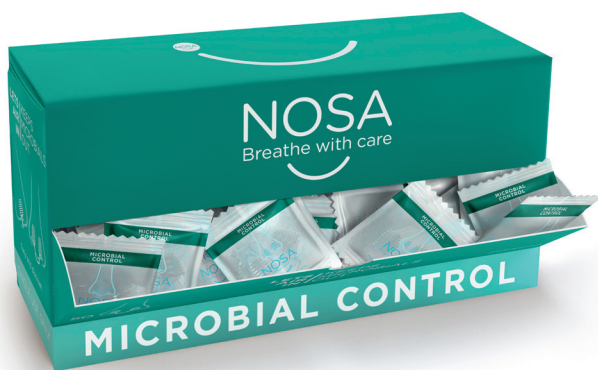
50-pack Art.Nr: 30130501