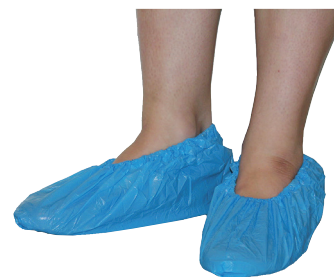
REF 211541 REF 211545