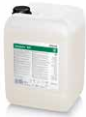
Sekumatic NDT 10 L can