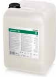
Sekumatic NDT 20 L can