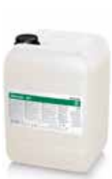
Sekumatic NDT 5 L can

Cleaning and disinfection of medical and surgical instruments and medical devices, suitable for use in washers, tunnel washers disinfectors and washing cabins