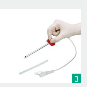
Remove the protection tube to begin the puncture.