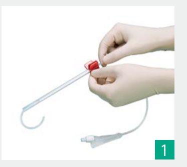
The catheter is already in the cannula. Keep the protection tube on the cannula