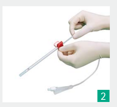
Pull the catheter until the tip is right below the cannula bevel.