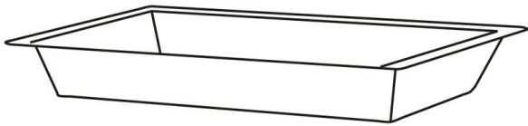
1 Tray, 145 × 130 × 35 mm