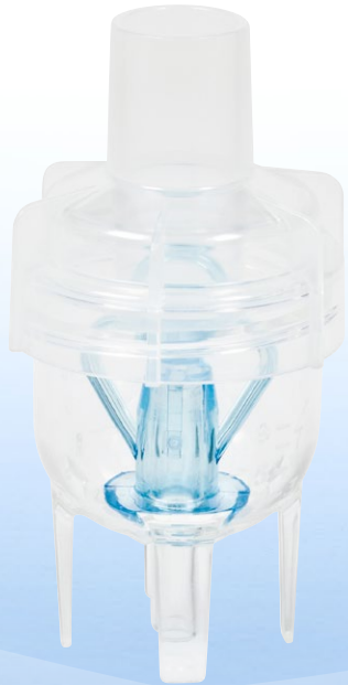
Misty Max 10™ Disposable nebulizer