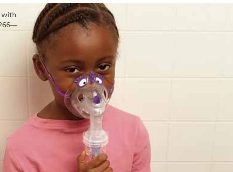
Nebulizer (shown with dragon mask 001266—order separately)