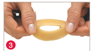
3 Stretch for an improved fit