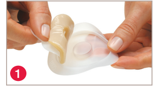
1 Remove from plastic tray