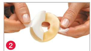
2 Remove both release liners