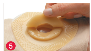
5 Stack for an improved fit